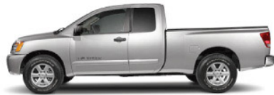
SV KING CAB AND CREW CAB