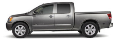
SL CREW CAB