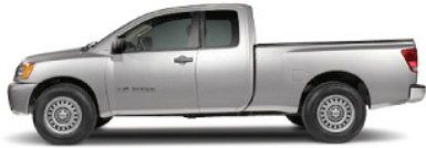
S KING CAB AND CREW CAB