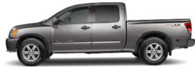
PRO-4X KING CAB AND CREW CAB